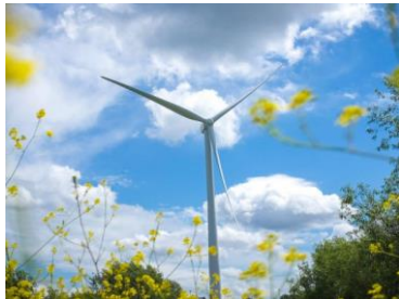
Decarbonisation & energy strategy