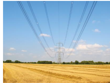
Grid and network management