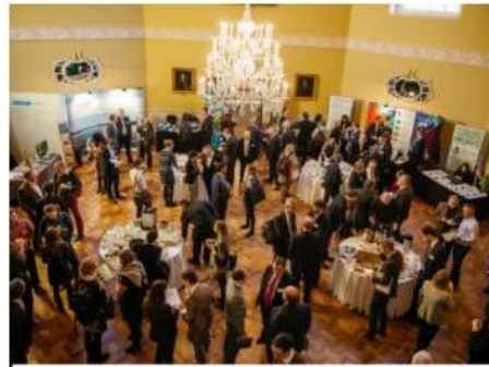
Renewable Futures Exhibition