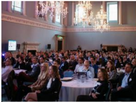
Renewable Futures Conference