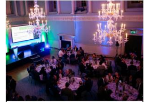
Green Energy Awards